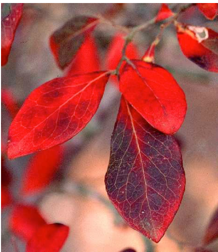
Farkleberry provides great native fall color

Treat the earth well: it was not given to you by your parents, it was loaned to you by your children. We do not inherit the Earth from our Ancestors, we borrow it from our Children. —American Indian Proverb