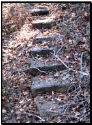
Stone steps at Lockhart State Park

community-based wetland, riparian, and coastal habitat restoration projects that build diverse partnerships and foster local natural resource stewardship through education, outreach, and training activities. The Five-Star Restoration Challenge Grant program is open to any public or private entity. Applications must be postmarked by March 3, 2003. http://www.nfwf.org/programs/5star-rfp.htm