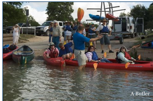
A Little Help at Launch